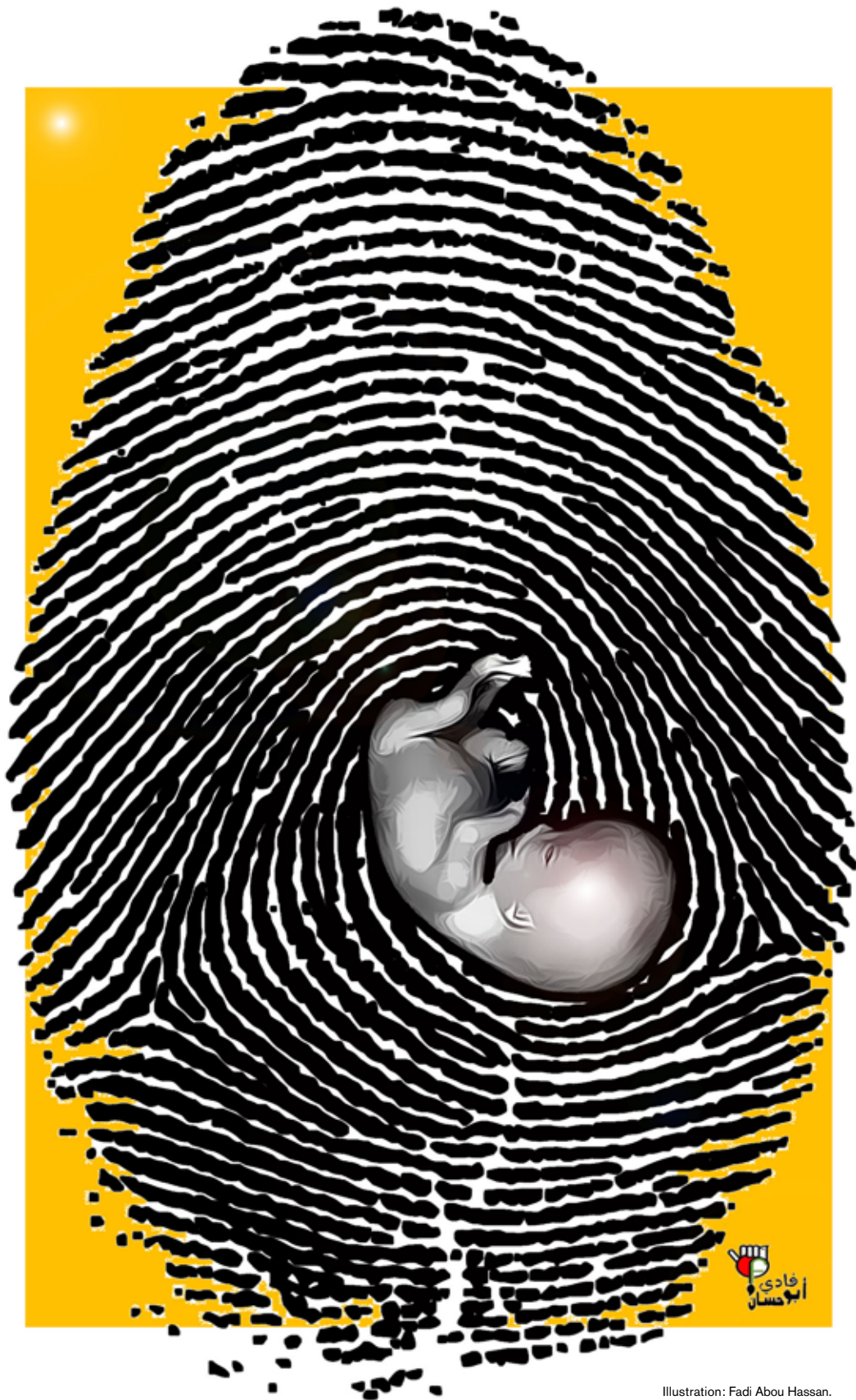
Illustration: Fadi Abou Hassan.

SAFE HAVENS FOR ARTISTS AT RISK – A NORDIC PERSPECTIVE Moriska Paviljongen, Malmö, November 11–12