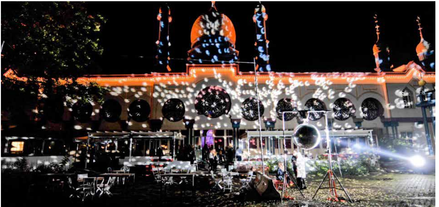
Moriska Paviljongen Malmö Folkets Park.