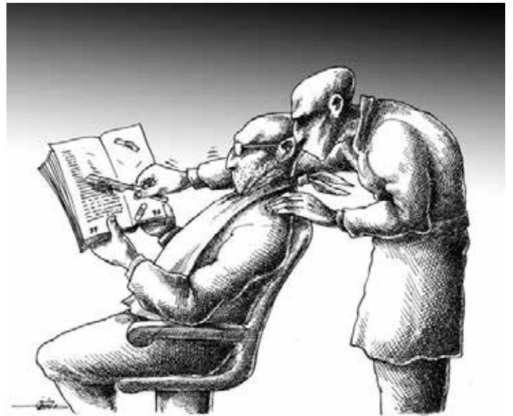
Illustration: Mana Neyestani.