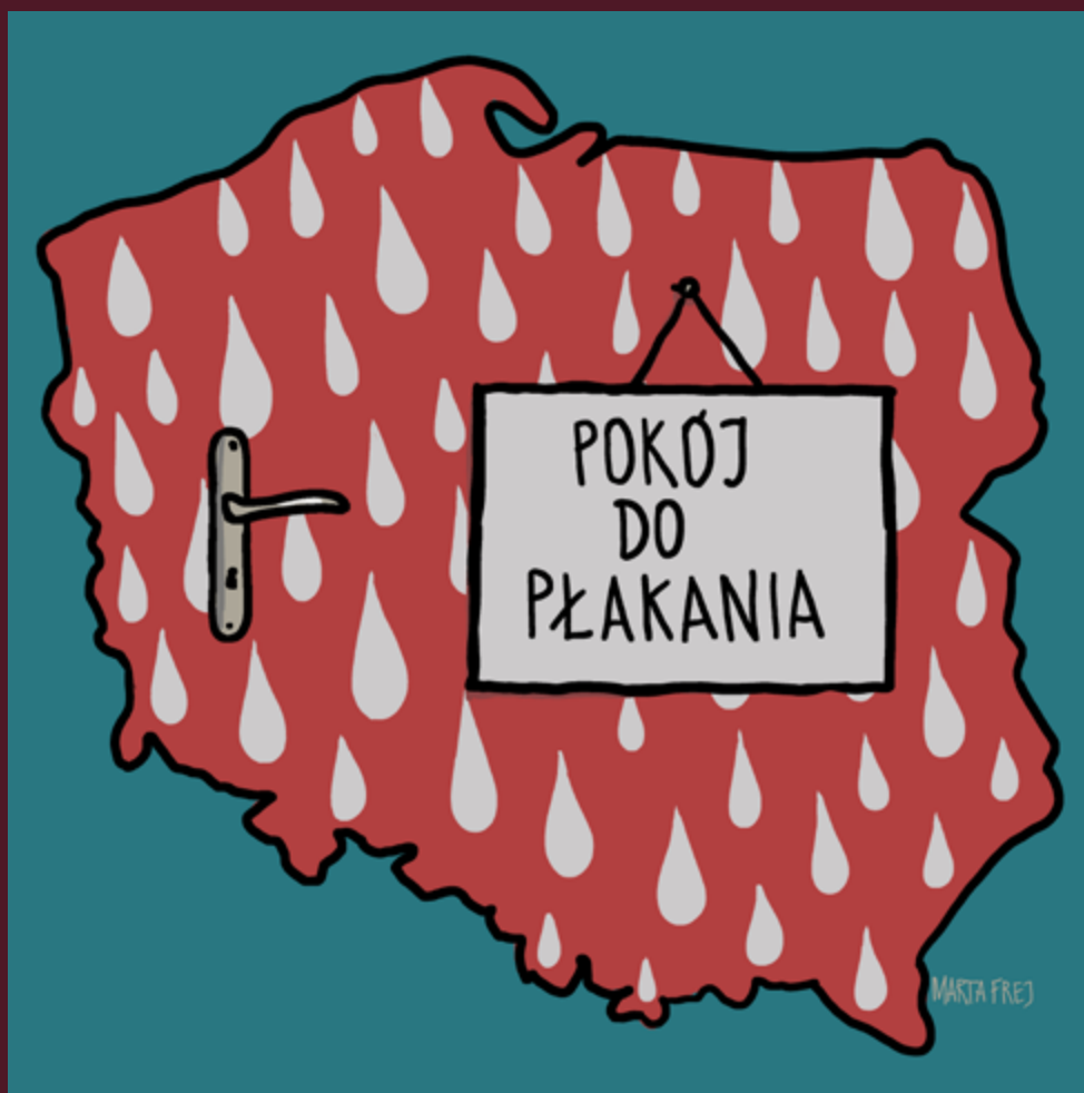
Unnamed (Weeping room) By Marta Frej