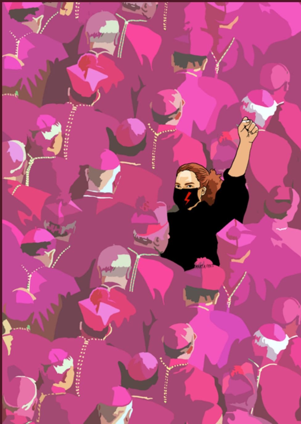
Polityka episkopat (Episcopal policy) By Marta Frej