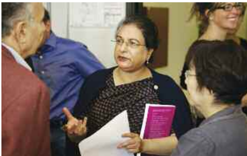
Former UN Special Representative of the Secretary General on Human Rights Defenders, Hina Jilani at a Front Line Defenders seminar in Norway, 2010.