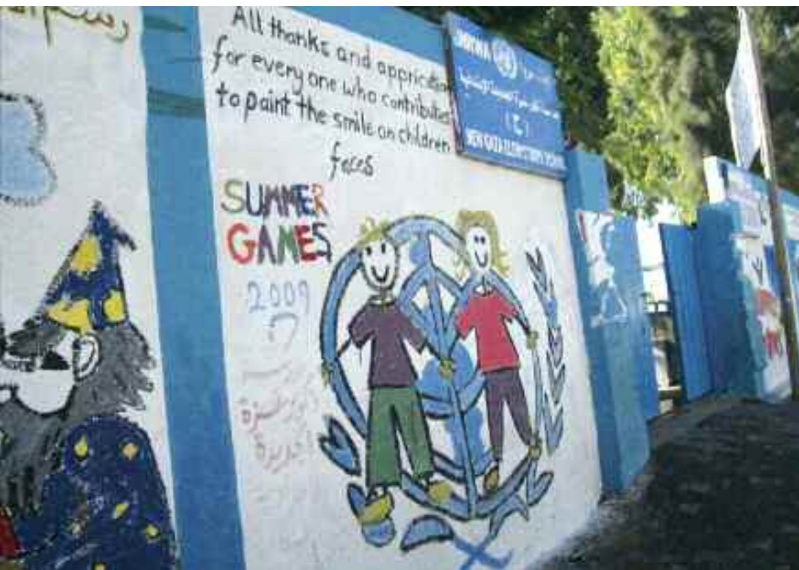
UNRWA building, Gaza

In practice, this is a crucial point. Many individual UN officials are personally committed to human rights, and some act energetically to defend human rights and protect human rights defenders. But other UN employees have no human rights mandate; lack a personal commitment to human rights; are reluctant to take initiatives of which their organisation may not approve; or are afraid that the host government will declare them persona non grata and force them to leave if they take up issues that are politically sensitive (and in many countries this is indeed a real risk).