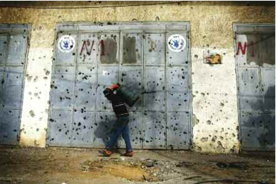
World Food Programme providing vital food supplies to communities in Gaza

Within each UN country team, at least one individual and sometimes an agency or team is responsible for monitoring human rights. If present, the OHCHR takes this responsibility. Otherwise, one or more human rights officers -or alternatively UN officials working on democracy and governance - will be appointed to fill this role. Not all UN officials have expertise in human rights: Resident Coordinators and other UN staff have access to human rights advisers based in UN regional offices or in Geneva if they need expert advice on human rights issues or UN human rights standards and guidelines.