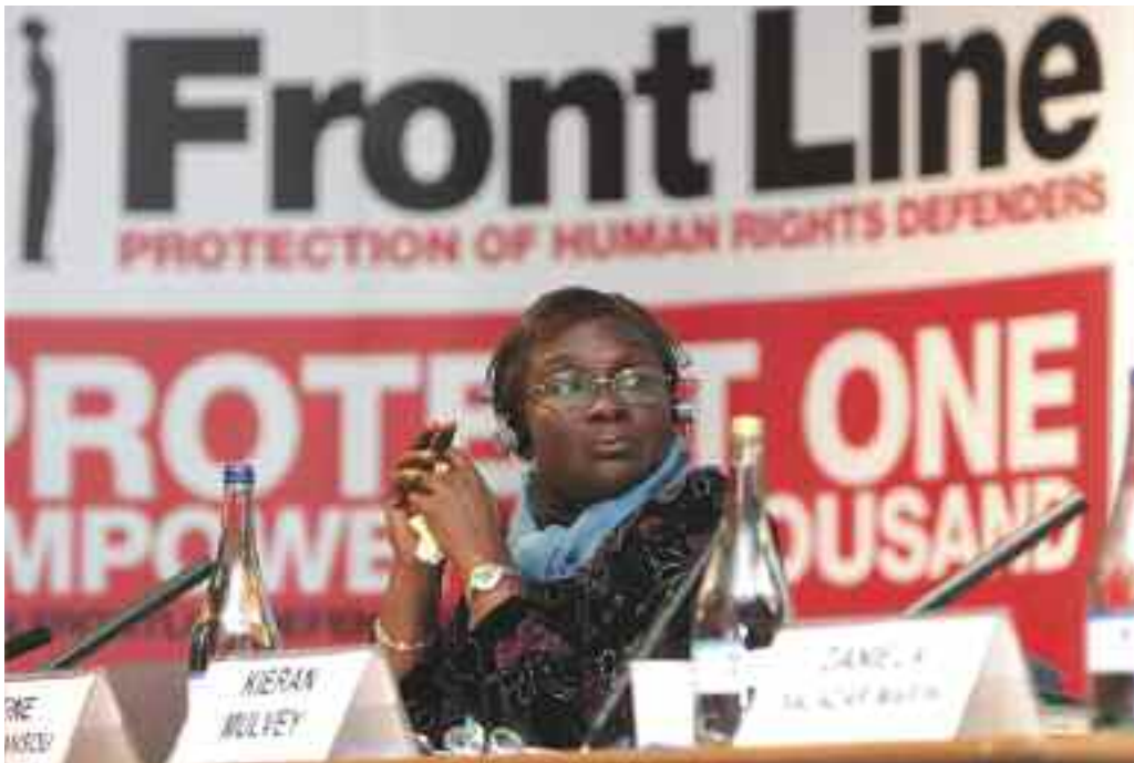
Reine Alapini-Gansou, Special Rapporteur on Human Rights Defenders in Africa, at the Dublin Platform 2011.

. . . . . www.aseansec.org/publications/TOR-of-AICHR.pdf