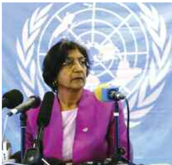
Navi Pillay, UN High Commissioner for Human Rights, holds a press conference in Juba at the end of an official visit to South Sudan, May 2012.