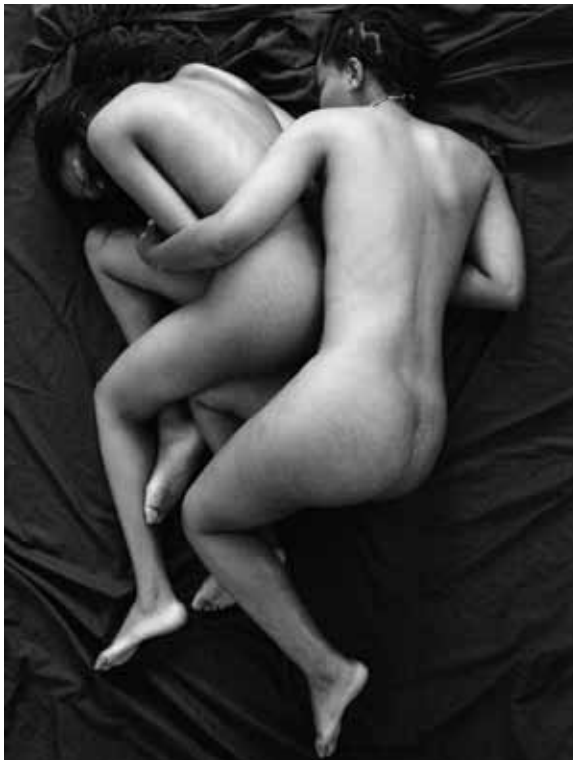
Being, Triptych 1, Silver gelatin print, 30x22,5 cm, Zanele Muholi, 2007

Zanele Muholi is one of the most brilliant but provocative photographers in the new South Africa, celebrated for her humane and tender images of lesbian couples in the townships. When she came out, she said, she realised that there were no photographs that spoke to her. Photography was a largely male occupation “men photographed women”, and there were few black artists using a camera. Her aim was to “capture the reality of what is going on” in work that she describes as “mapping