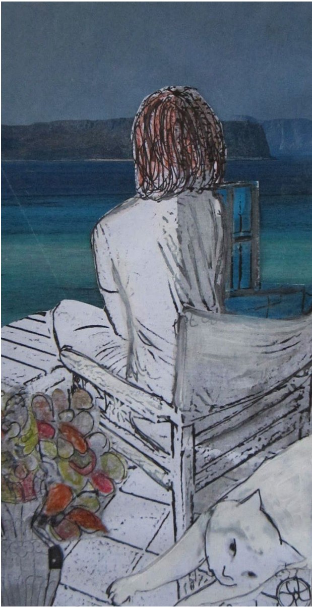
Photography and collage, Rawya Sadek 2019